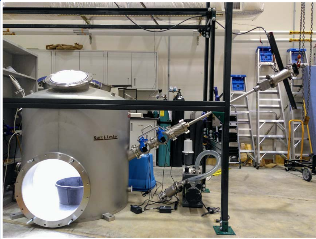
The Vertical Gun Range, pictured, is the only facility of its kind on the East Coast.